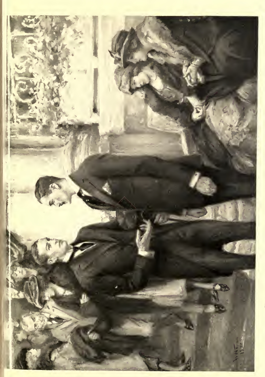
Tabs extended his hand. Braithwaite made no motion to take it.